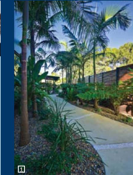
1-2: Kiah Beach Houses