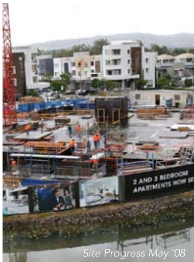
Site Progress May '08

The latest building – the nine level 38 Riverwalk - incorporates all of the positive elements of inner city living that have been experienced during the development of Riverwalk.