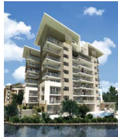
Impressionists View – Daytime External Pool Side

"At Riverwalk, we have created an urban village to suit people who want